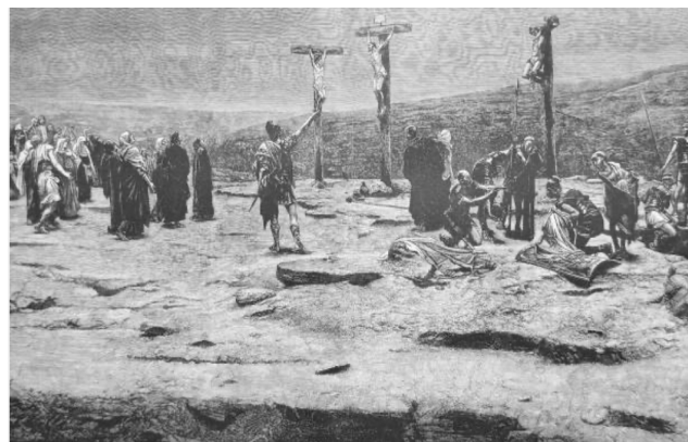
Golgotha, The Crucifixion